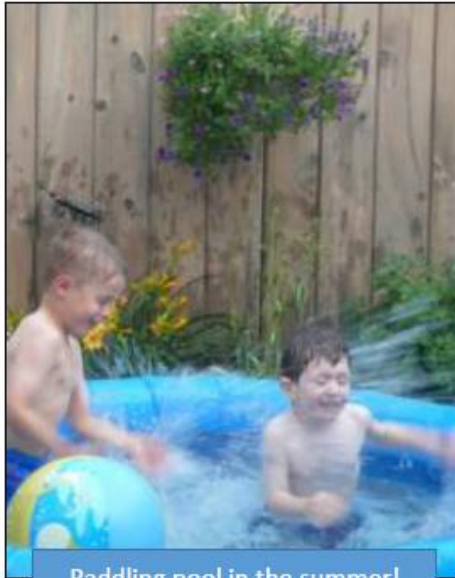
Paddling pool in the summer!

Look at the pictures and talk about which use water. Which do you think you would miss most if you had to cut back on using water?