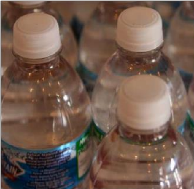
Pictured: Bottled water many have been reliant on.

Many people across the south-east and south-west of the UK have faced further issues following heavy snow fall, with thousands of houses having their water cut off completely. Water suppliers said the speed in which the heavy snow melted and the temperatures increased led to burst water mains and leaks.