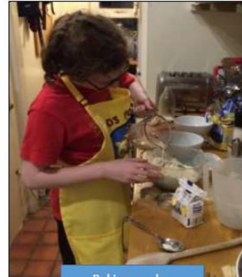
Baking a cake.