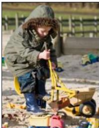
Playing in a sandpit.