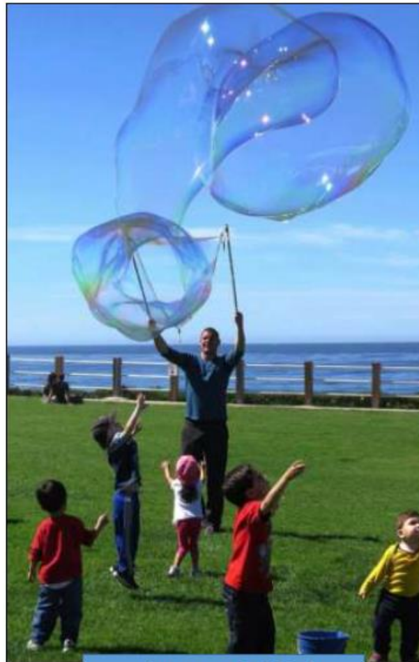
Blowing giant bubbles!