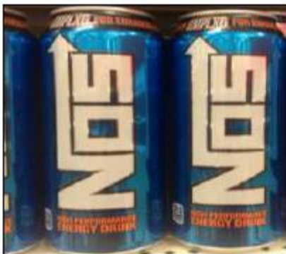
Pictured: Typical energy drink.

Sales of energy drinks to children under 16 have been banned in most supermarkets because of worries about high levels of sugar and caffeine. Supermarkets including Asda, Waitrose, Tesco and the Co-op are banning the drinks as is the pharmacy chain Boots.