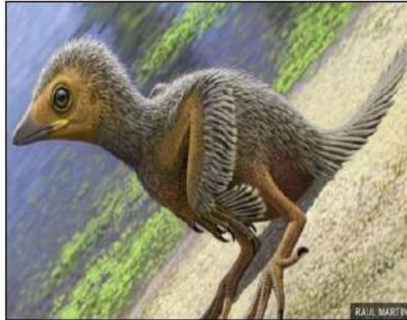
Pictured: What the bird might have looked like.

The bird is thought to have had teeth and clawed fingers on each wing and looked a lot like modern day birds of today.